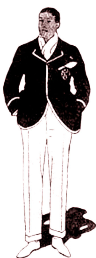
(7) Sketch for a blue club jacket. Bound in primrose, with club initials on the pocket