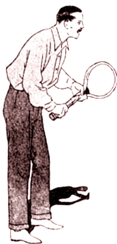
(4) Sketch of cotton cheviot shirt and trousers for tennis in two shades of grey, the trousers darker